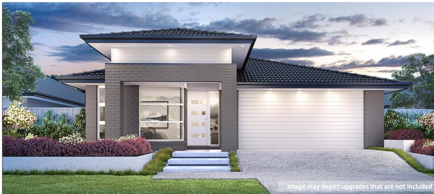
Image may depict upgrades that are not included

Floor area: 222.32m 2 / 23.93sq | Block Size: 480m 2 Address: Lot 605 Banyan Hill, Cumbalum NSW 2478