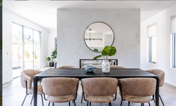
Kingston 30 (Spencer Facade)