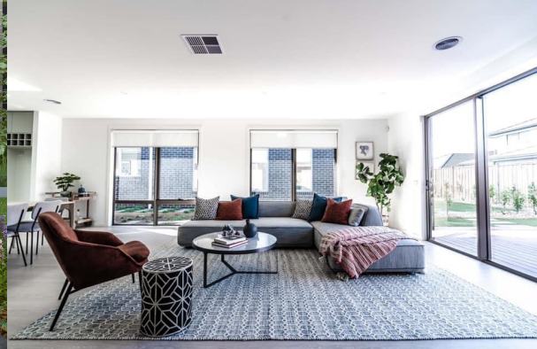
Cameron 16 (Collins Facade)