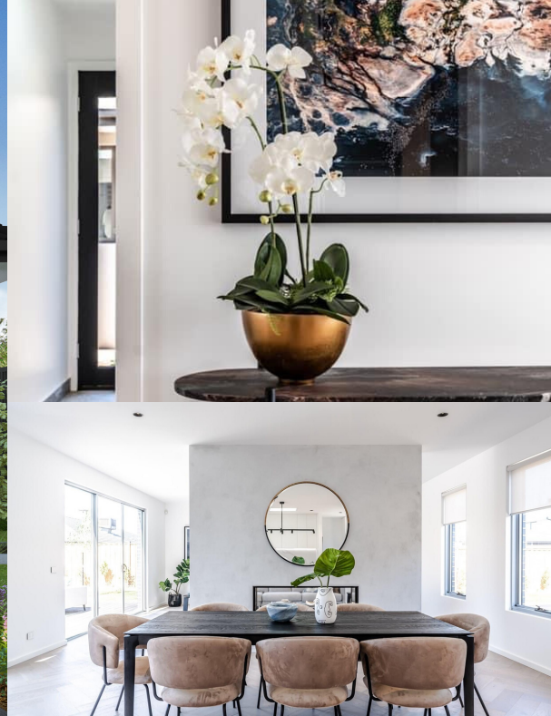
Dylan 20 (Collins Facade)