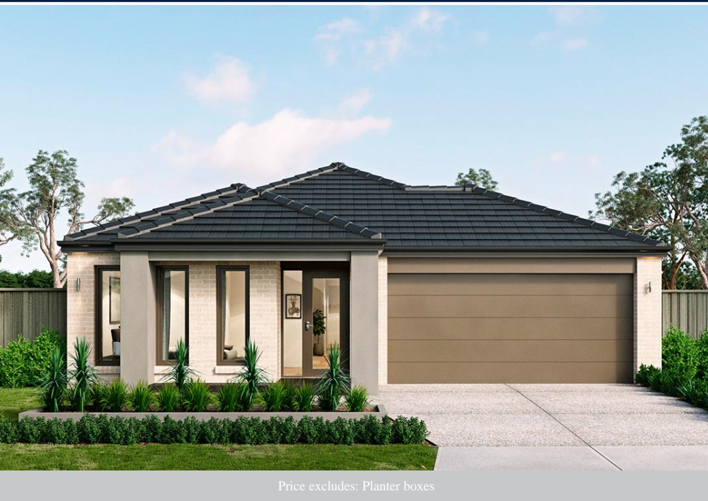
Price excludes: Planter boxes