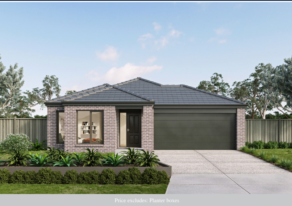
Price excludes: Planter boxes