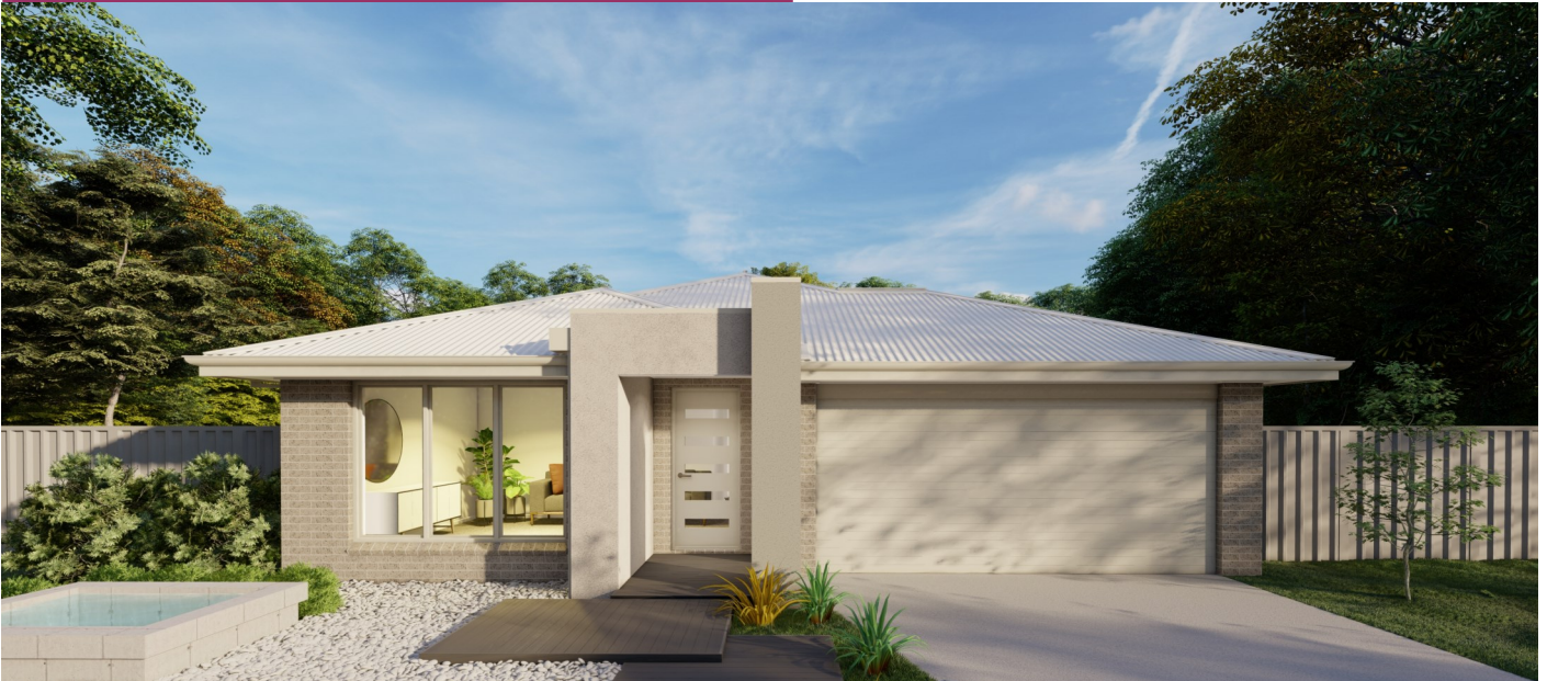
Image & façade shown for illustrative purposes