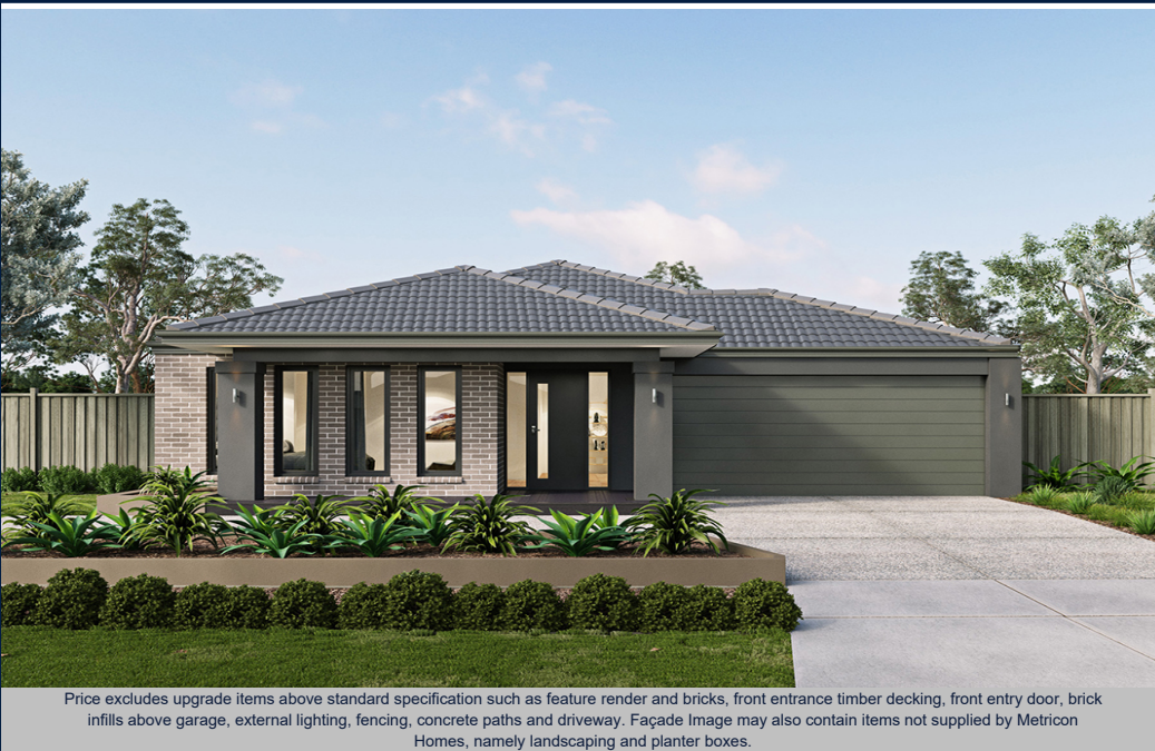
Price excludes upgrade items above standard specification such as feature render and bricks, front entrance timber decking, front entry door, brick infills above garage, external lighting, fencing, concrete paths and driveway. Façade Image may also contain items not supplied by Metricon Homes, namely landscaping and planter boxes.