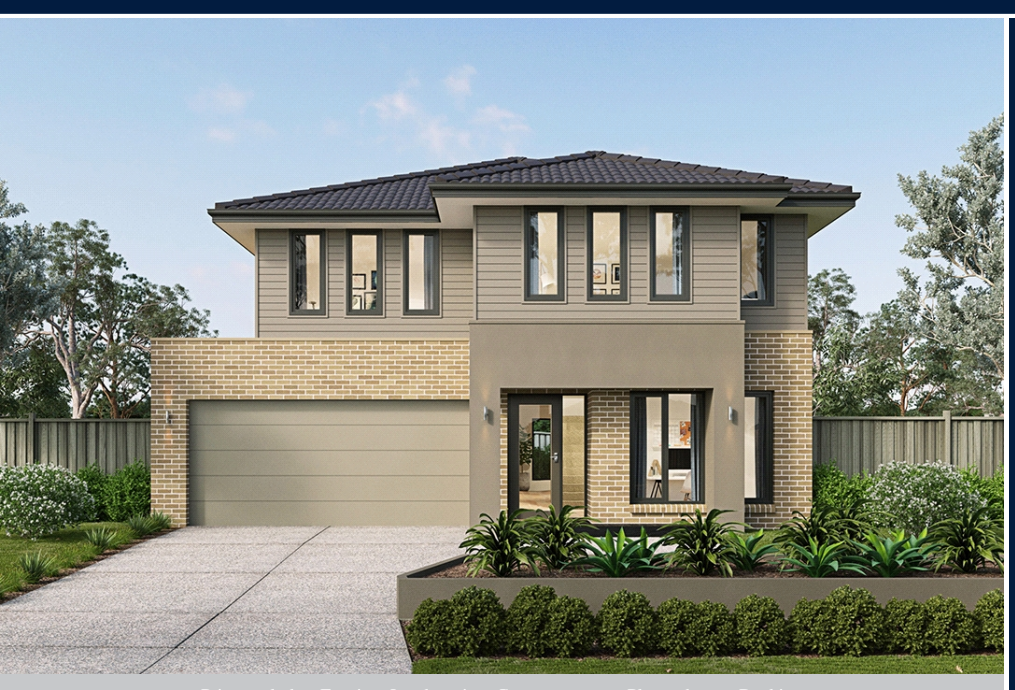
Price excludes: Fencing, Landscaping, Concrete pavers, Planter boxes, Deckin