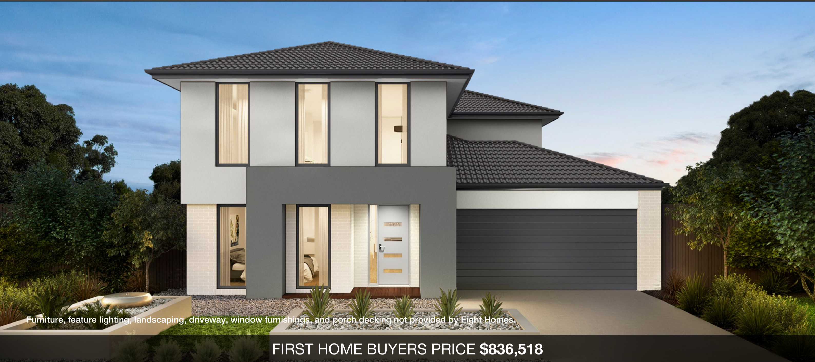
Furniture, feature lighting, landscaping, driveway, window furnishings, and porch decking not provided by Eight Homes.

Price includes standard floorplan with S1 facade.