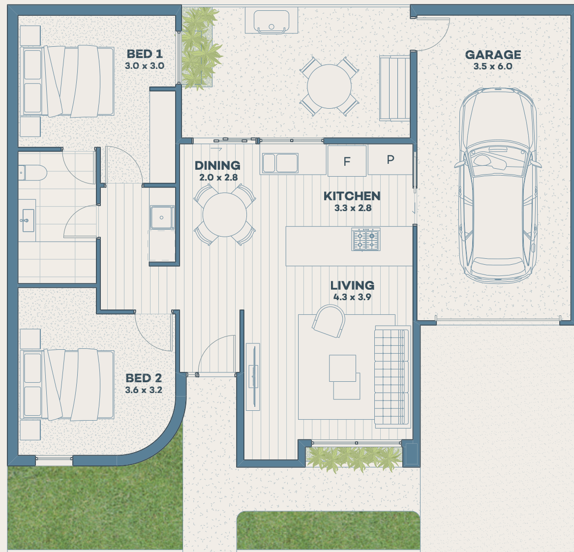
GROUND FLOOR PLAN 534 LEAFY STREET, LARA VIC 3212