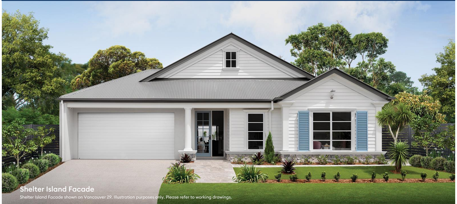
Shelter Island Facade

Shelter Island Facade shown on Vancouver 29. Illustration purposes only. Please refer to working drawings.