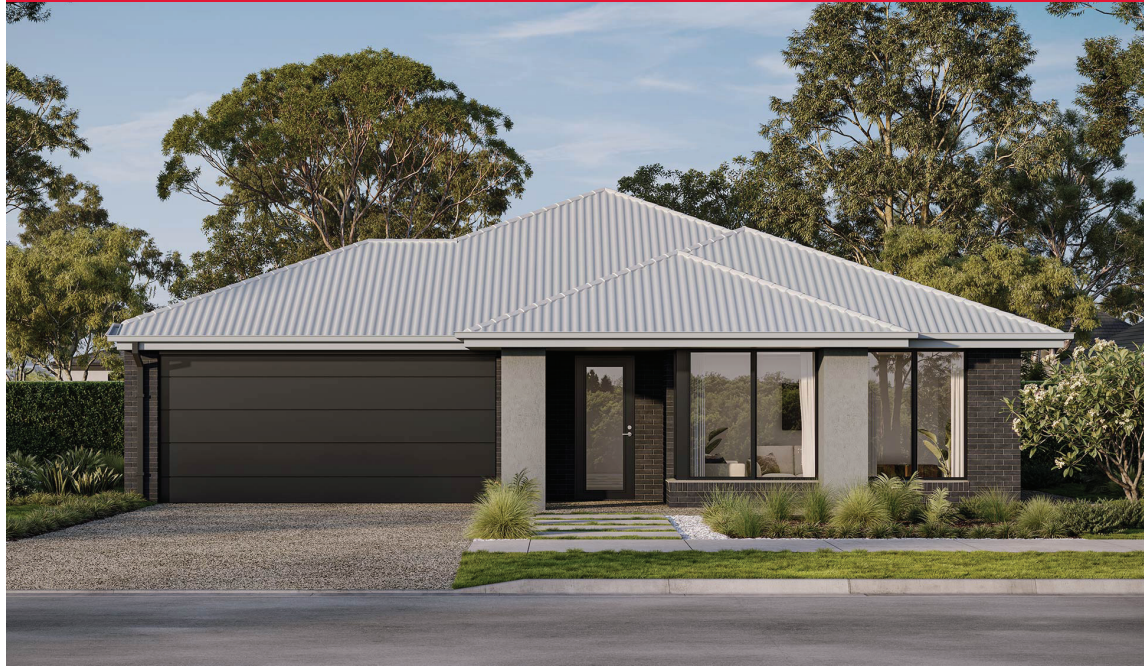
TAMWORTH 32 | ELEVATE RANGE

VILLAWOOD PAYS YOUR BUILDER DEPOSIT UP TO $25K