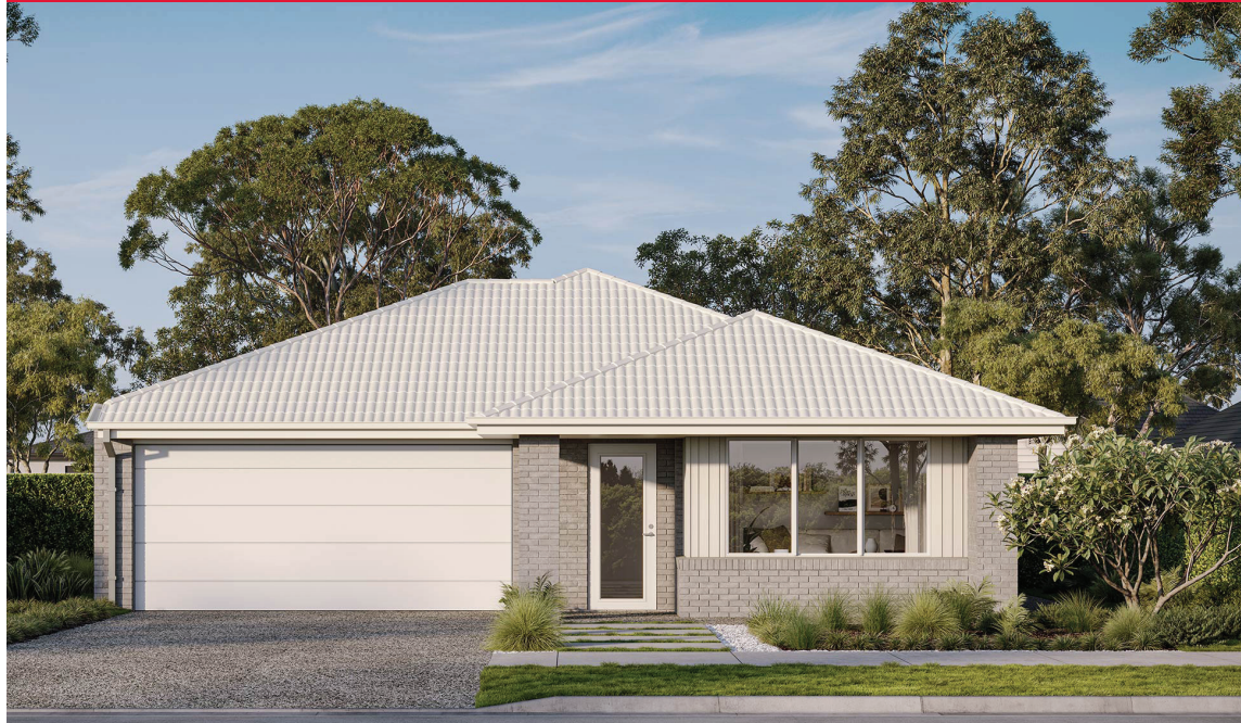
GRAMPIAN 19 | EMERGE RANGE