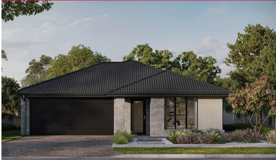
GRANITE 23 | EMERGE RANGE