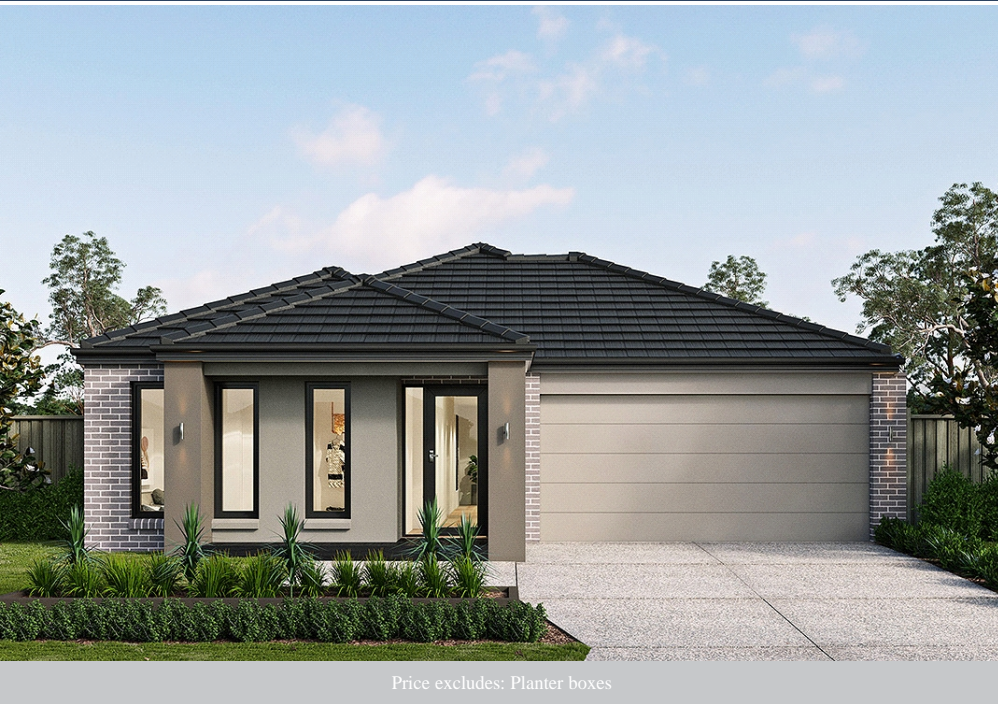
Price excludes: Planter boxes