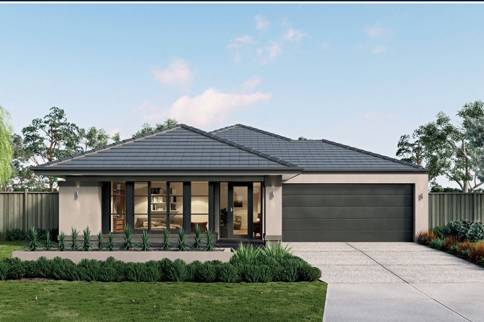
Image depicts items not supplied by Metricon namely landscaping, fencing, timber decking and paths. Image contains upgrade items.