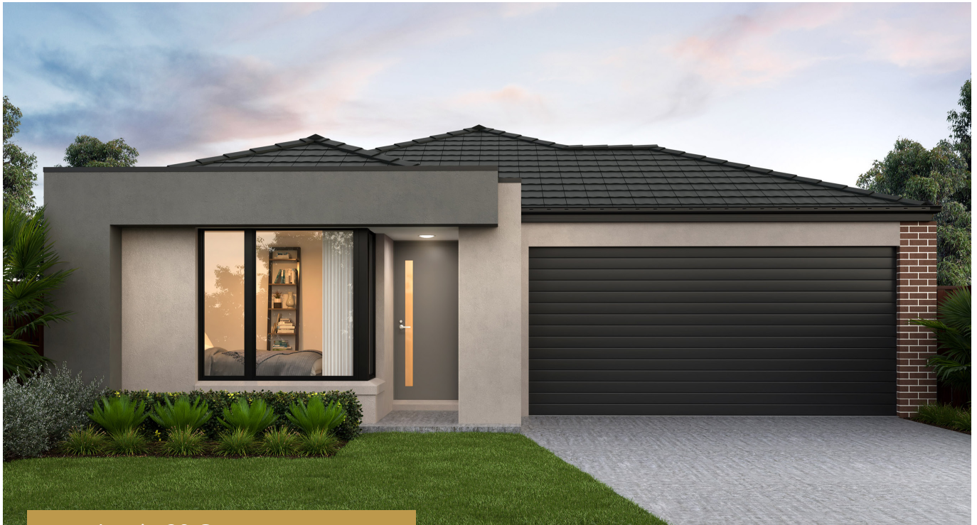
Austin 20 Contemporary

LOT 538 MILKMAIDS AVENUE , LITTLE SPRINGS ESTATE , DEANSIDE