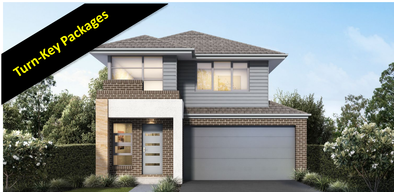
Rosebery 28 | Axis Facade

Facade images and landscaping may vary from this image