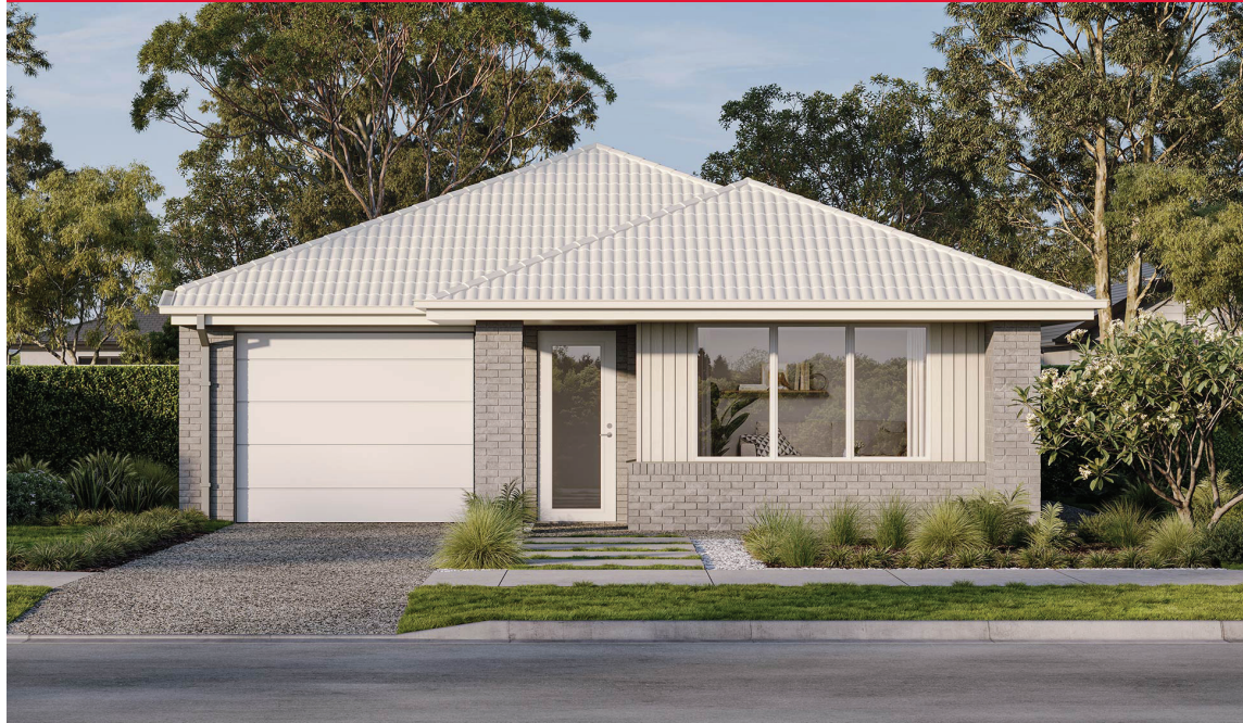
FINCH 18 | EMERGE RANGE