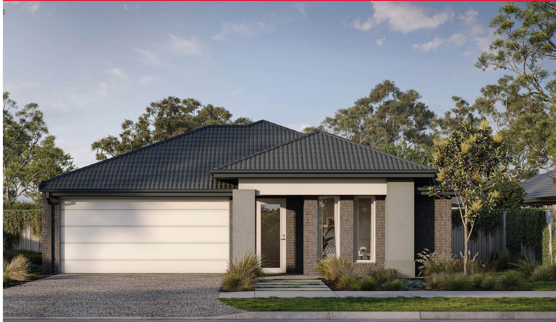
KIAMA 18 | EMERGE RANGE