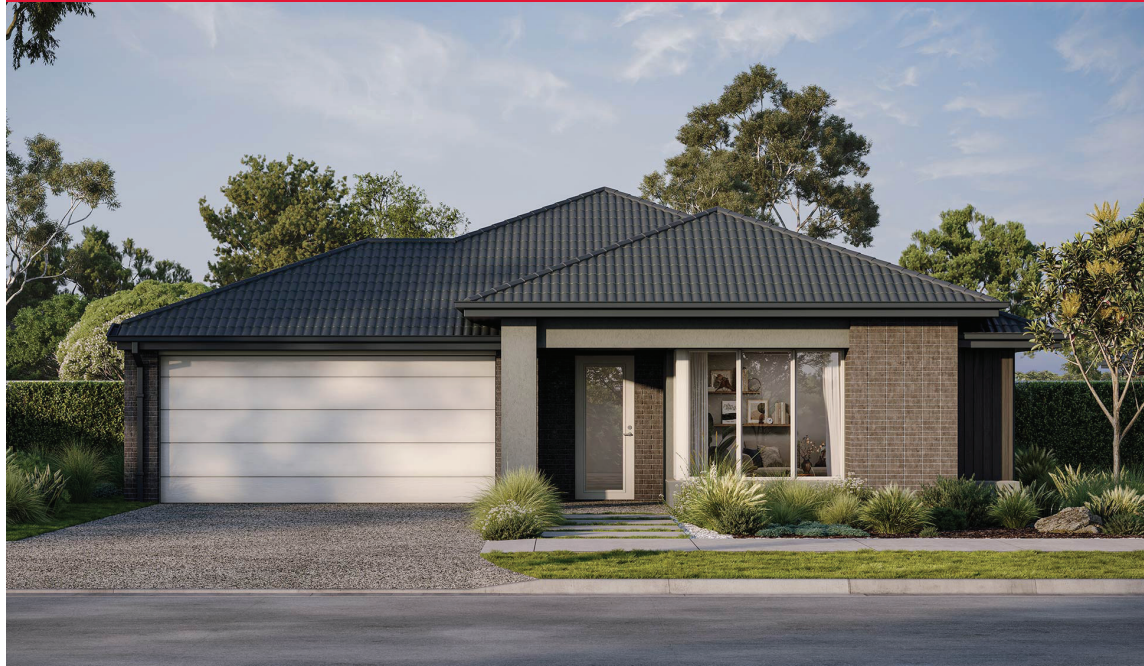
DANELLA 18 | EMERGE RANGE