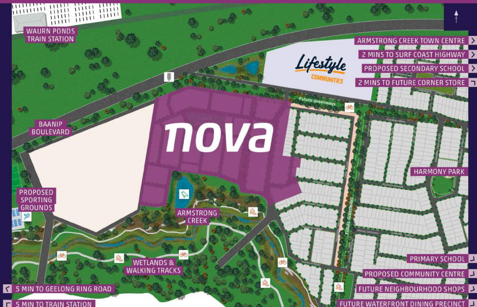
Future Boundary Road Greenway