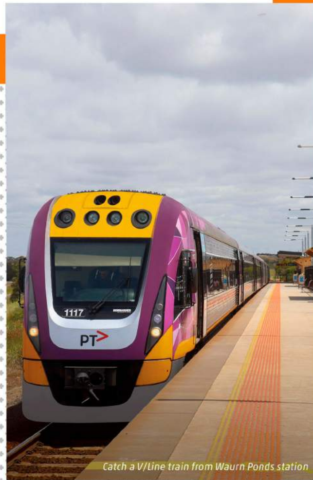
Catch a V/Line train from Waurm Ponds station