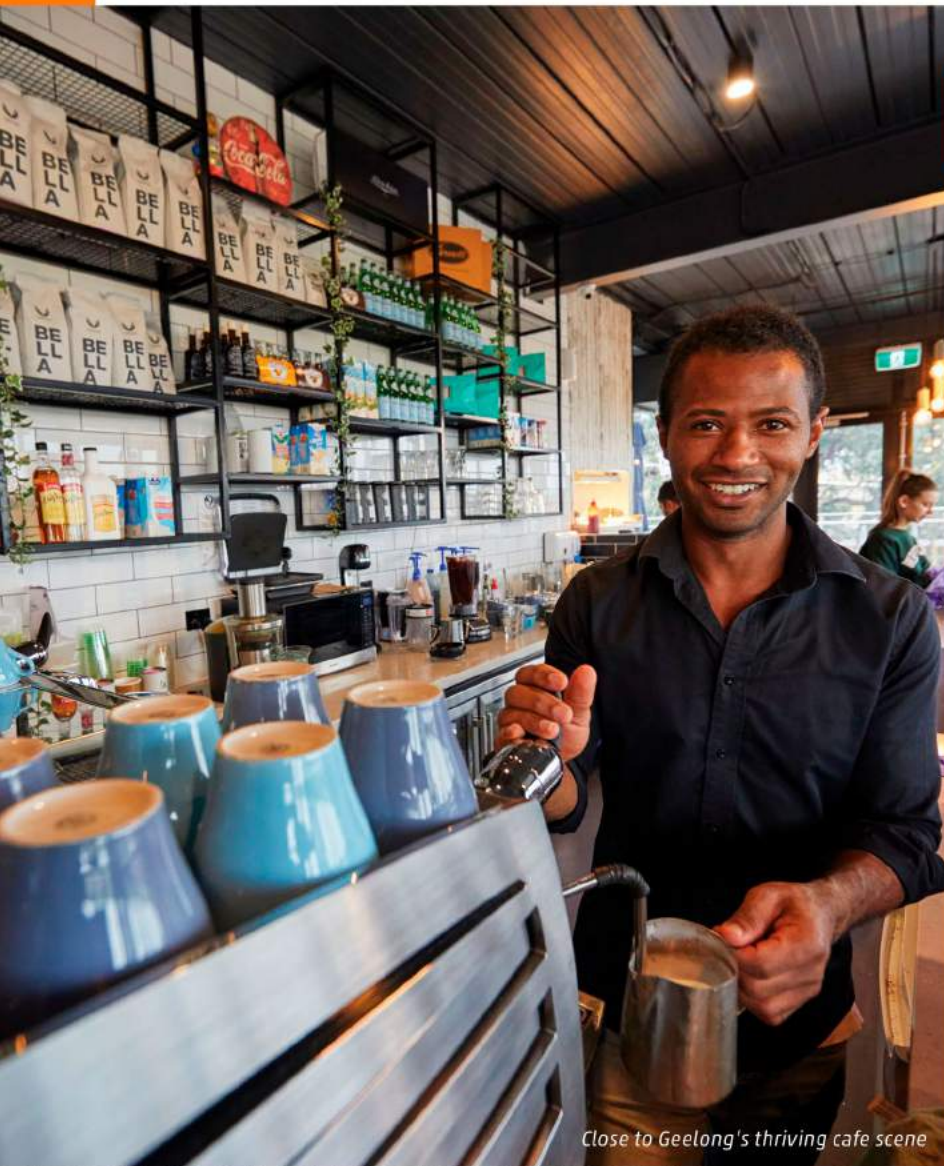
Close to Geelong's thriving cafe scene

Designed by Villawood Properties, ARMSTRONG features waterfront dining along Armstrong Creek, expansive parks and wetlands, schools, sportfields and local shops - giving you the ultimate in lifestyle amenity - and everything less than 5 minutes from your doorstep.