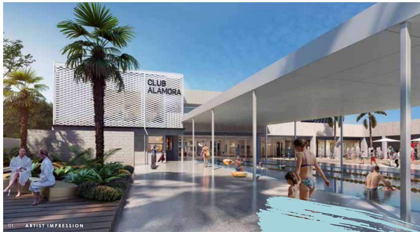
01. ARTIST IMPRESSION