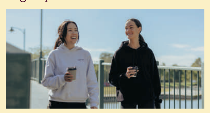
Enjoy a balanced lifestyle with ample walking trails in and around the central lakes.